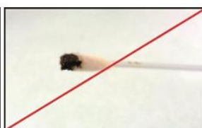
Too little stool